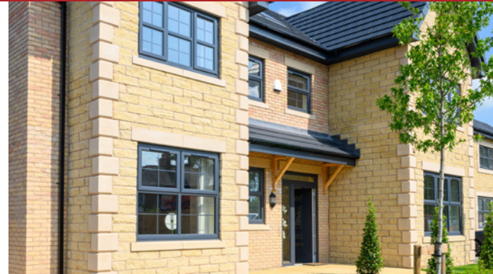
Peo & Seddo