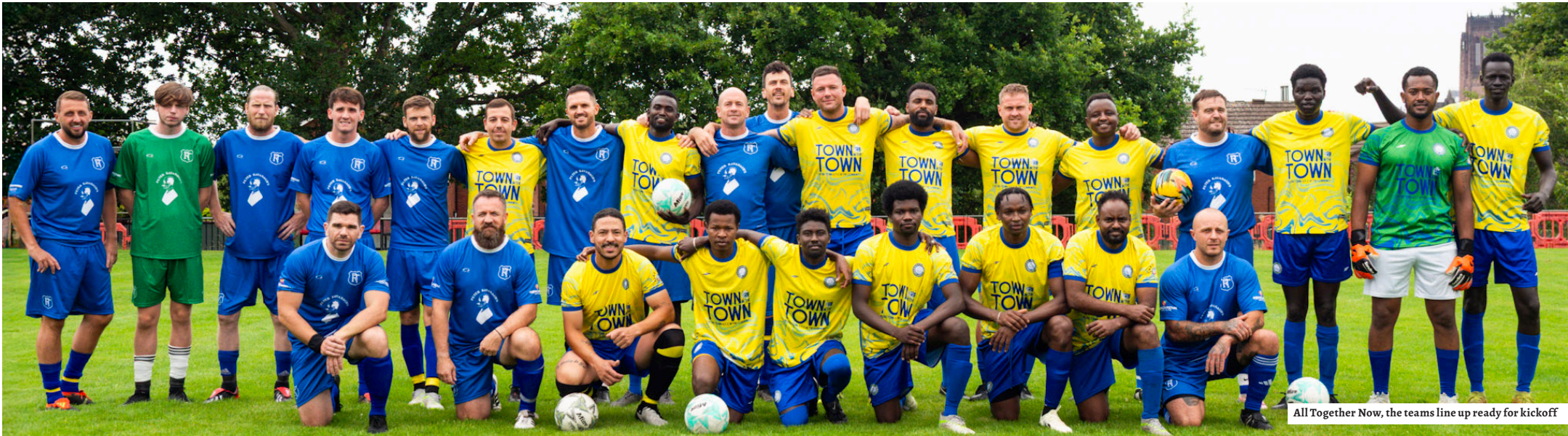
All Together Now, the teams line up ready for kickoff