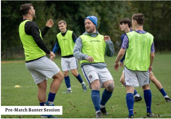
Pre-Match Banter Session