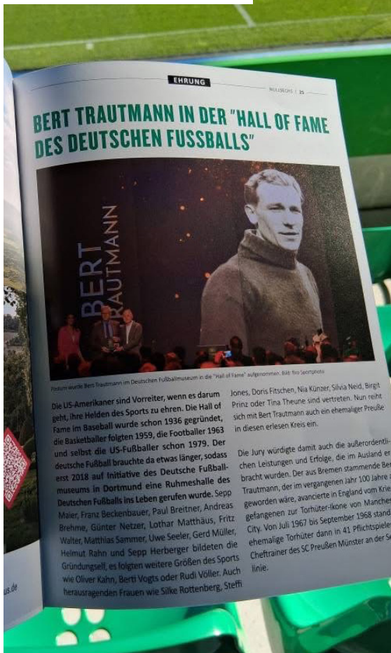
SC Preußen Münster matchday programme

All in all, it was a great day — rounded off perfectly with a currywurst and a beer. I hope to return in the future to see a Münster victory!"