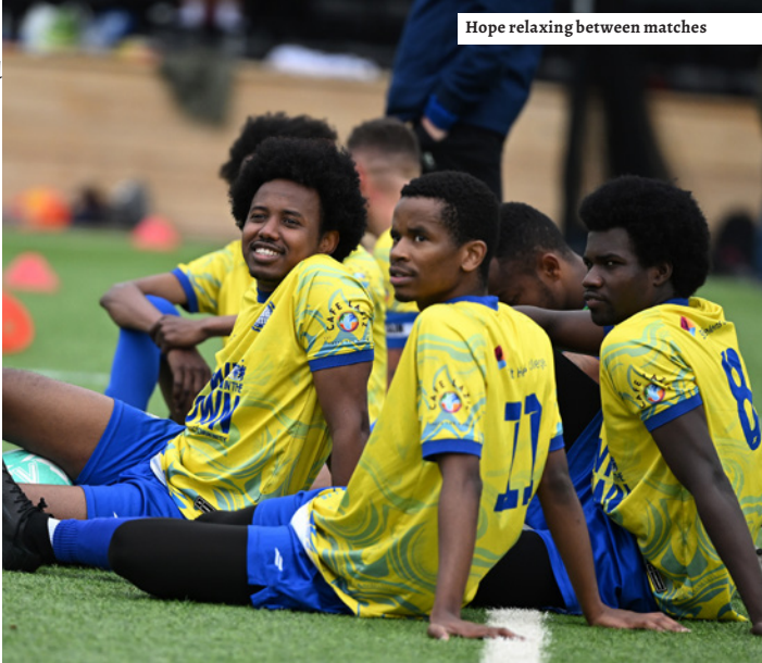
Hope relaxing between matches

Then, on Tuesday 14th October, the team travelled to the Liverpool FC Academy to take part in an 8-a-side tournament featuring teams representing LFC, Everton, Warrington, and the Wirral. Hope went on to win the tournament, remaining undefeated and conceding just one goal — thanks in no small part to our goalkeeper, who was named Player of the Tournament for his safe hands and outstanding performances.