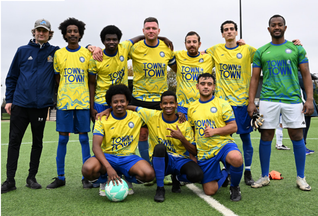
LFC tournament winners