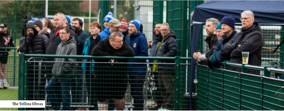
The Tellins Ultras