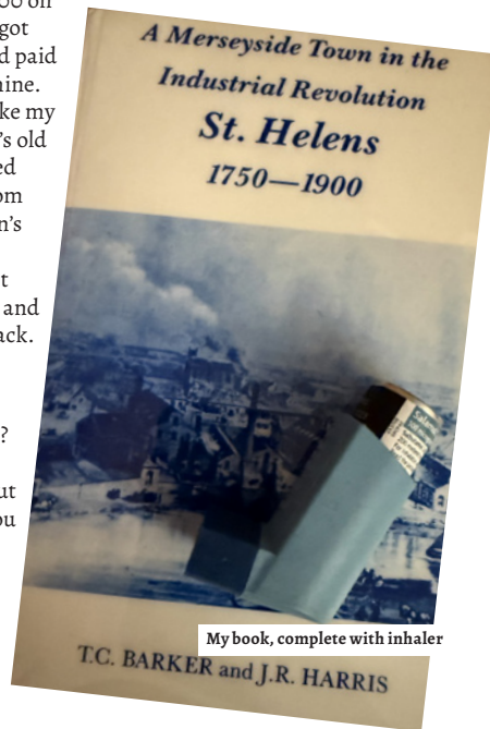
My book, complete with inhaler

It's easy to sit there and be negative. We all feel it—the way the town's changed, the loss of industry, the divide between those who have and those who haven't, pubs shutting, the cost of living. I could go on. But the people who need help aren't the problem—they're often the ones caught in the middle of everything that's gone wrong.