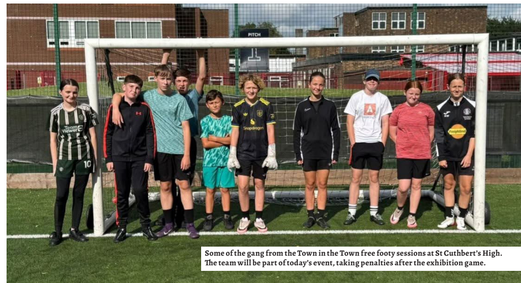
Some of the gang from the Town in the Town free footy sessions at St Cuthbert's High. The team will be part of today's event, taking penalties after the exhibition game.

Look around today. There are stalls here from charities supporting families, bereavement, single parents, recovery from alcohol and drug issues, and people seeking asylum. Real people doing real work, offering a helping hand. They say you're only two paycheques away from homelessness. One bereavement away from things spiralling. And when you look at what's happening in places like Sudan, it puts a lot into perspective.