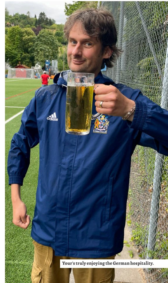
Your's truly enjoying the German hospitality.