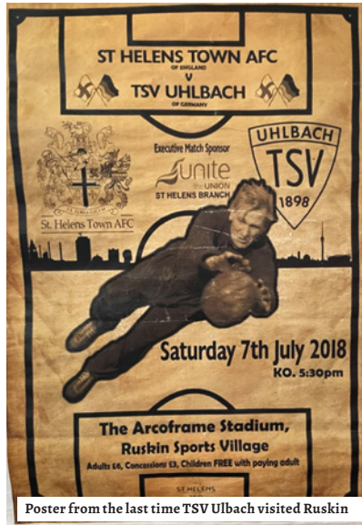
Poster from the last time TSV Uhlbach visited Ruskin