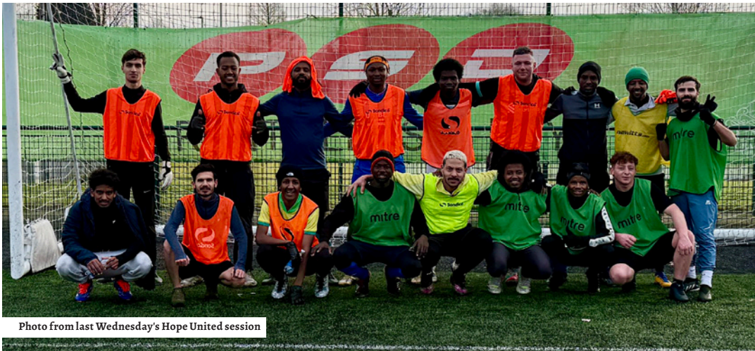
Photo from last Wednesday's Hope United session