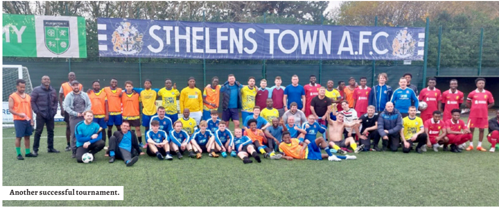
Another successful tournament.

Our charity arm, Town in the Town, was active again last week, hosting another Inclusion Cup at Ruskin.