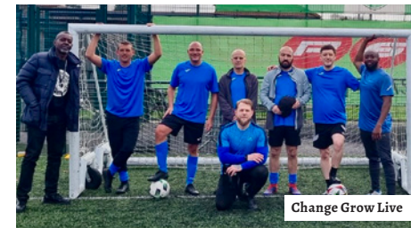
Change Grow Live