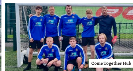
Come Together Hub