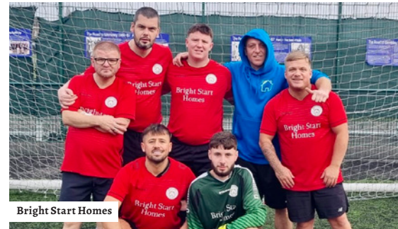
Bright Start Homes