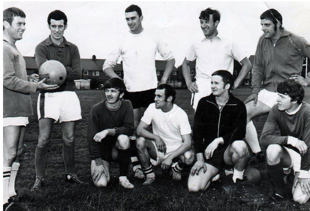
St Helens Town AFC - 1969-70