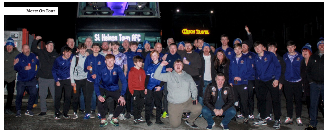
Mertz On Tour