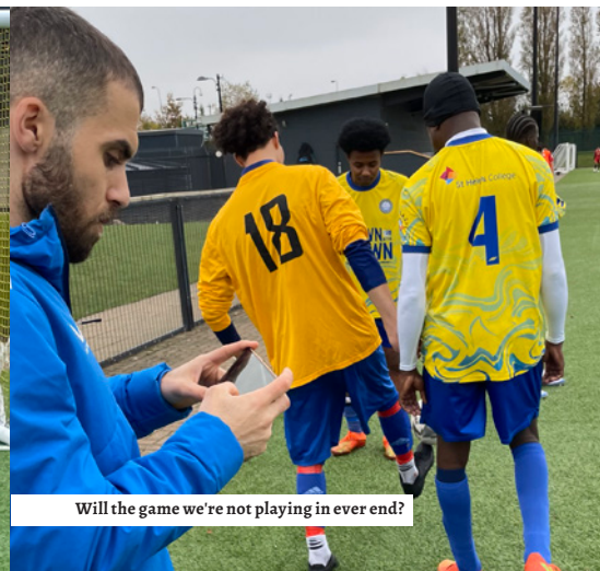
Will the game we're not playing in ever end?