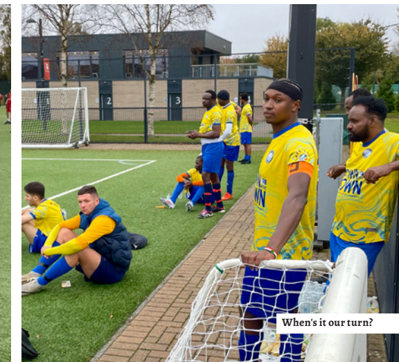
When's it our turn?