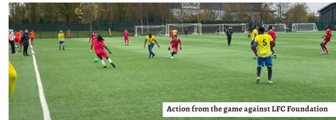
Action from the game against LFC Foundation