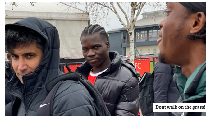
Dont walk on the grass!