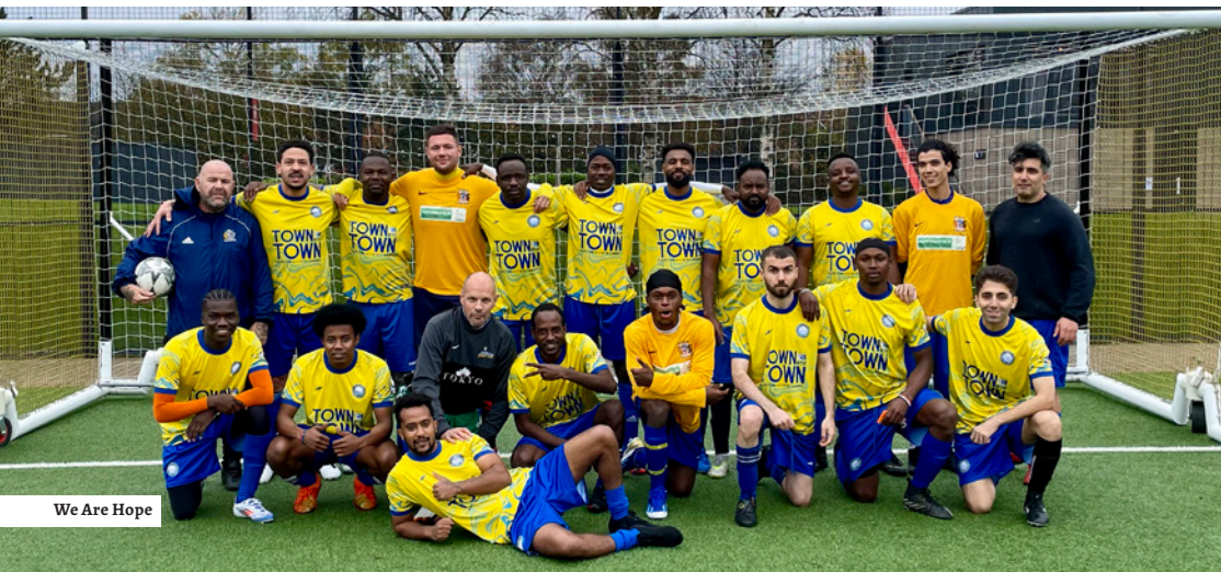
We Are Hope